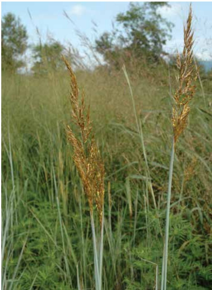
Fig. 7. Indiangrass is easily recognizable by the blueish hue of its stems and the large yellow seedheads. Indiangrass is the latest of the NWSG to produce seedheads; typically they appear in July and August.

Probably the most widely used variety in the Mid-South, Rumsey was developed from plant material from south-central Illinois. It produced yields similar to Cheyenne in variety trials conducted by the University of Kentucky.