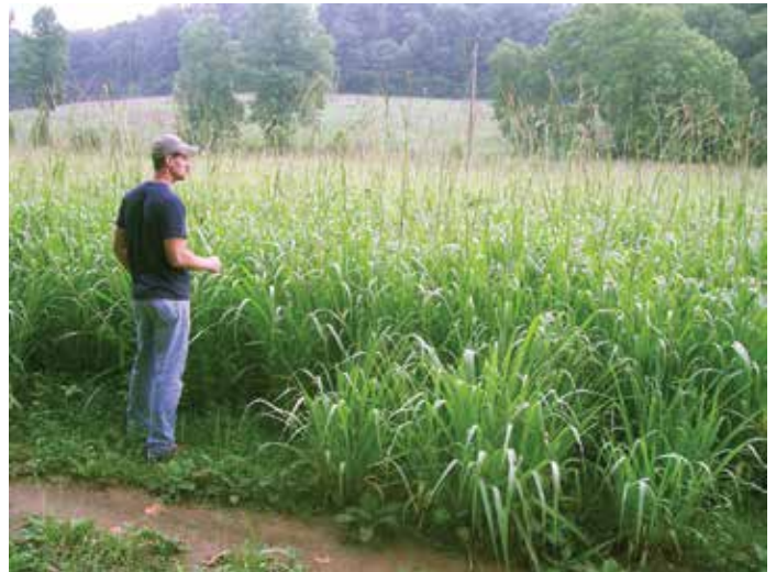
Fig. 8. Eastern gamagrass produces impressive yields of quality forage. Its seedheads appear in June and are quite distinctive.

Like switchgrass, eastern gamagrass produces very high yields and tolerates wet sites (Fig 8). It begins spring growth sooner than the other NWSG and also maintains growth later in the season than the other species – with the exception of indiangrass. It can support high stocking rates due to its high productivity.