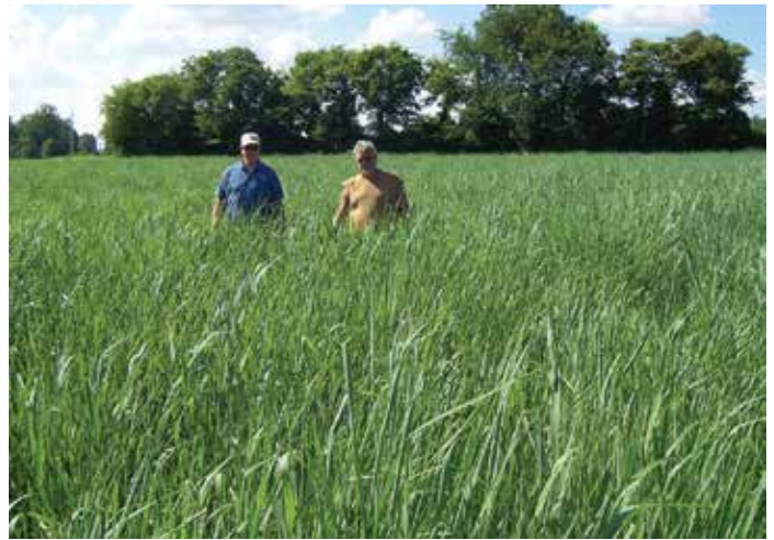
Fig. 4. Switchgrass is a tall, robust grass that produces high yields. Seedheads are open “panicles” typical of the panic grasses and appear during mid- to late-June.

Developed from plant material collected in southern Texas, Alamo is a lowland variety that is currently considered the primary species for biofuel production. At maturity, Alamo commonly reaches heights of 10 feet and can produce substantial amounts of forage. Like