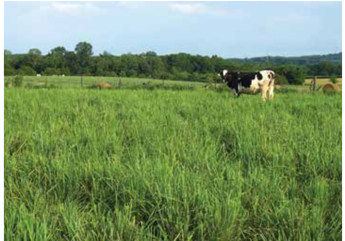
Fig. 9. Native warm-season grasses, such as this mixed stand of big bluestem and indiangrass, provide excellent grazing during the summer and provide a buffer against drought. Bred Holstein heifers (1000 – 1100 lb) gained nearly 1.9 lb per day during 2010, one of the hottest summers on record in Tennessee. Such grasses can provide a strong complement to existing cool-season grass forages.

All of these publications may be accessed online by going to: http://nativegrasses.utk.edu .