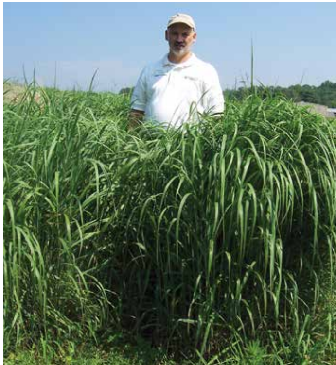
Fig. 2. This 18-year-old stand of cave-in-rock switchgrass continues to produce large volumes of quality forage.

As with any forage, hay quality is strongly influenced by timing of harvest. Harvest of NWSG at late-boot stage will typically produce hay with protein levels of 10 percent or higher. However, like most warm-season forages, NWSG will test at levels below those for cool-season forages harvested at a comparable maturity level. This is partly because proteins in NWSG do not break down as quickly during ruminant digestion and bypass the rumen; thus, they are referred to as “bypass proteins.” Because bypass proteins can be absorbed in the intestines, animal performance on NWSG exceeds what we would predict based on forage sample analysis. For example, when grazed, NWSG routinely produce from 1.5 – 2.5 lb of daily gain in steers (Fig 3). Furthermore, NWSG forage quality is not diminished by endophyte fungi, a substantial problem with tall fescue.