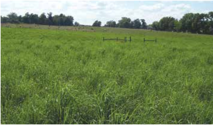
Fig. 5. Big bluestem is a fine-leaved species that produces good yields of excellent forage. Seedheads are produced in June and July and are easily recognized by their “turkey-foot” appearance.

easier to manage. It tends to mature somewhat later than switchgrass. There are many varieties of big bluestem available, but here we consider only two.