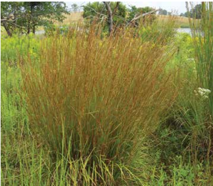
Fig. 6. A mature clump of little bluestem, a smaller bunch grass that often shows a reddish hue on its stems. Note the mature big bluestem plant in the background on the right. Despite its smaller size, little bluestem can produce desirable forages – even on poor ground.

A more recent release, OZ-70 was developed from plant material collected from a number of locations in the Mid-South. As such, it is one of the first varieties of big bluestem from this region. Like other varieties of big bluestem, it has wide site adaptation, but will not tolerate flooding as well as switchgrass.